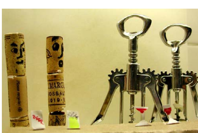
So would you girls like to come up to our place? (Jane Auerbach, Los