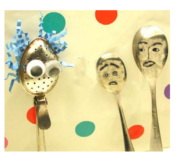
"No, honey, it's not all that tea that makes Grandma act that way these days."