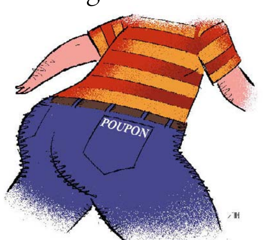
Grey Poupon and Dockers are expected